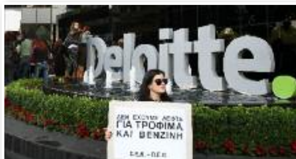
"We have no money for food and petrol"